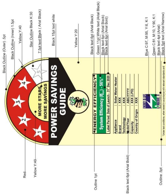
Figure 1 Label for SWH system